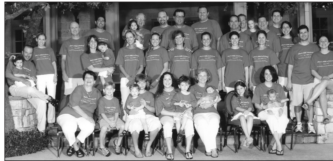
The Cohen-Small-Waldman Family